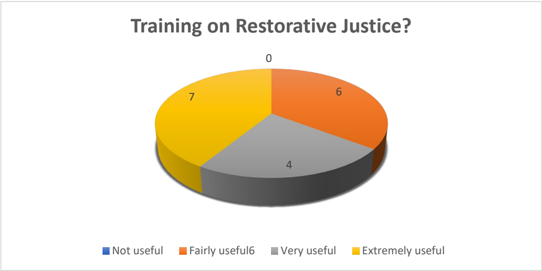
Chart 1: Respondents Perception of Usefulness of RJ Training

The survey demonstrated that 18 respondents were aware of the test project, and the majority had ‘limited’ or ‘fair’ knowledge of RJ. All respondents agreed that training on RJ would be beneficial and indicated the elements and format preferred, with almost all stakeholders noting an interest in some specific thematic training.